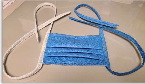
(The mask in this image is not made with cotton fabric)