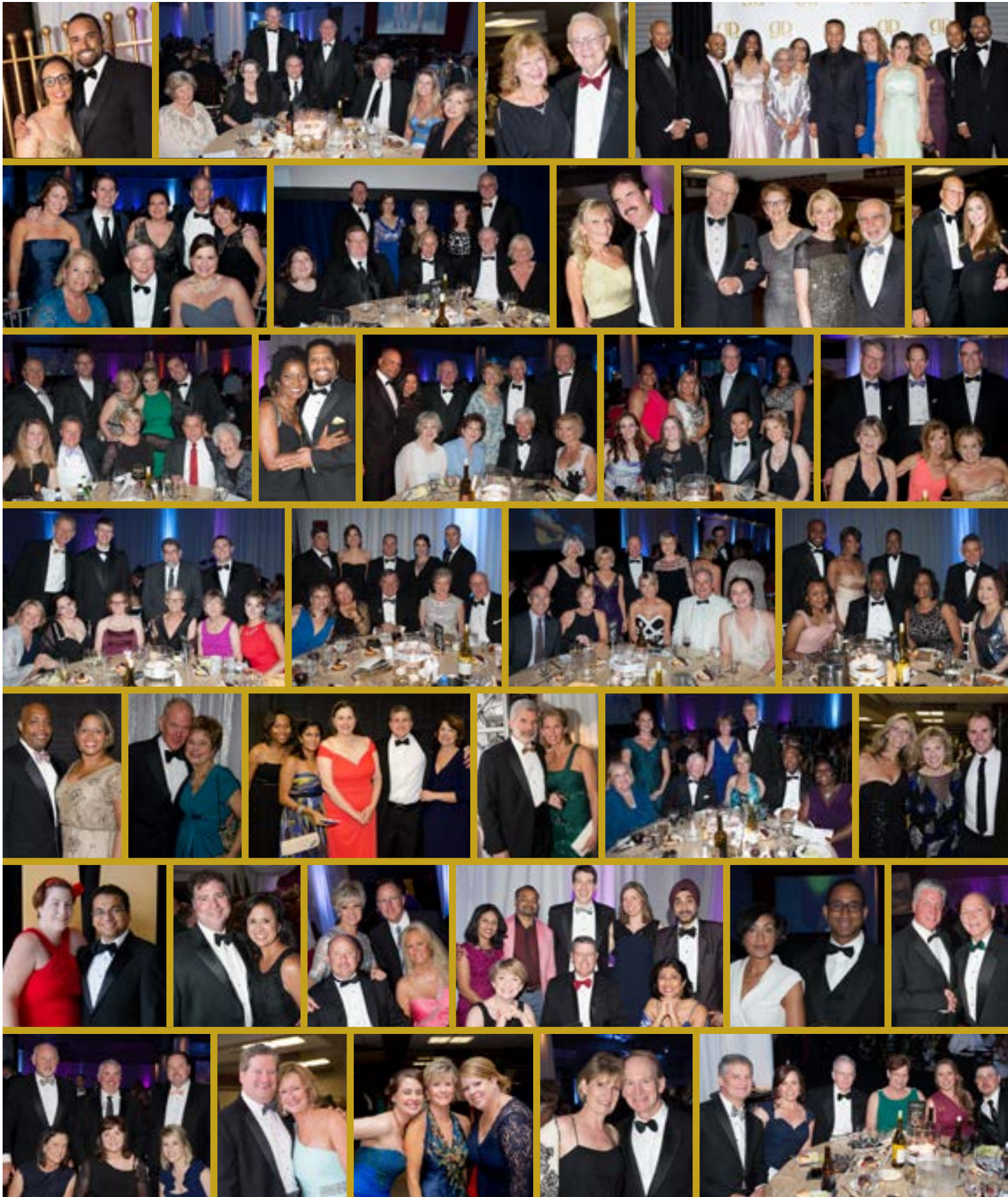
Sans captions to accommodate broader photographic coverage — each of the individuals pictured is a loyal supporter of TMH.