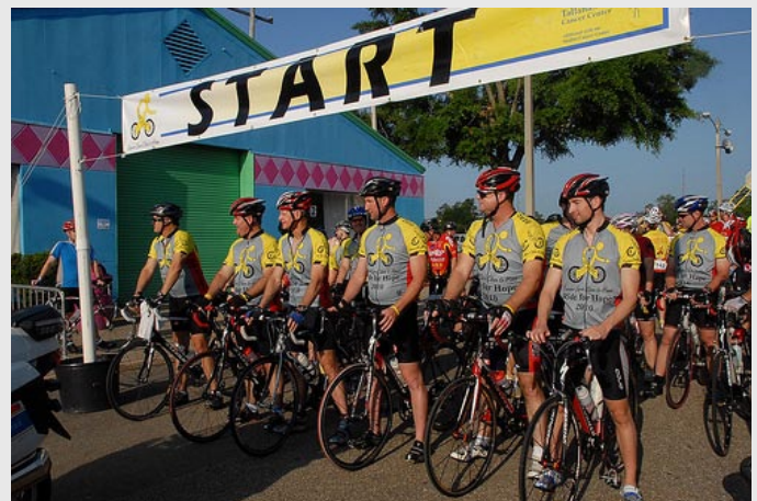
Riders jockey for starting position at the 2010 Ride for Hope.

The fun-filled weekend will kick off Friday evening, June 10, from 5:00 to 8:00 with the Ride for Hope Vendor Expo, Early Registration and Hero of Hope Award Ceremony. The Friday night festivities also include live music, buffet dinner, vendor expositions and demonstrations, many “give-a-ways” and much excitement as riders gear up for the next day.