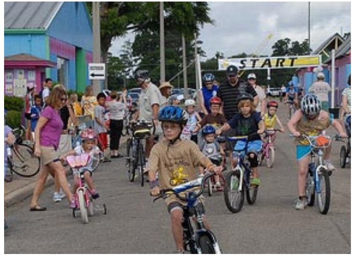
Children of all ages enjoy the Family Fun Ride/Walk during the 2010 Ride for Hope at the North Florida Fairgrounds.

On Saturday morning, June 11, cyclists will gather at the Fairgrounds to ride 100, 68, 40, or 13 miles on specially designed courses through Tallahassee's unique canopy roads, challenging rolling hills, and beautiful countryside. The 100-mile "Century" has an early morning start at 6:30, followed by the 68-mile "Metric Century" at 7:00, 40-mile at 7:30, and 13-mile at 8:30. The Fun Ride/Walk for children of all ages will begin at 10:00 and will be limited to the confines of the Fairgrounds.