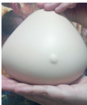
Nude Silicone Breast Forms