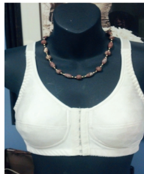
Front Closure Bras