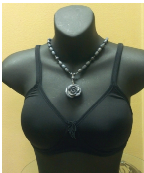
Molded Cup Bras