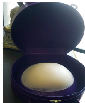
Partial Breast Forms