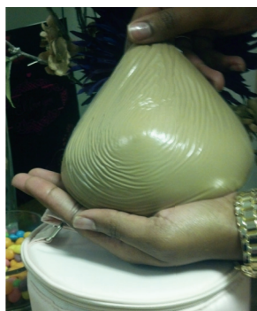
Tawny Silicone Breast Forms