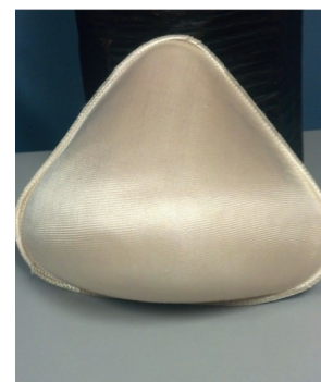
Lightweight Foam Breast Forms